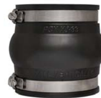
Rubber Expansion Coupling