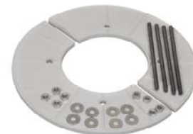
Underdeck Clamp & Hardware